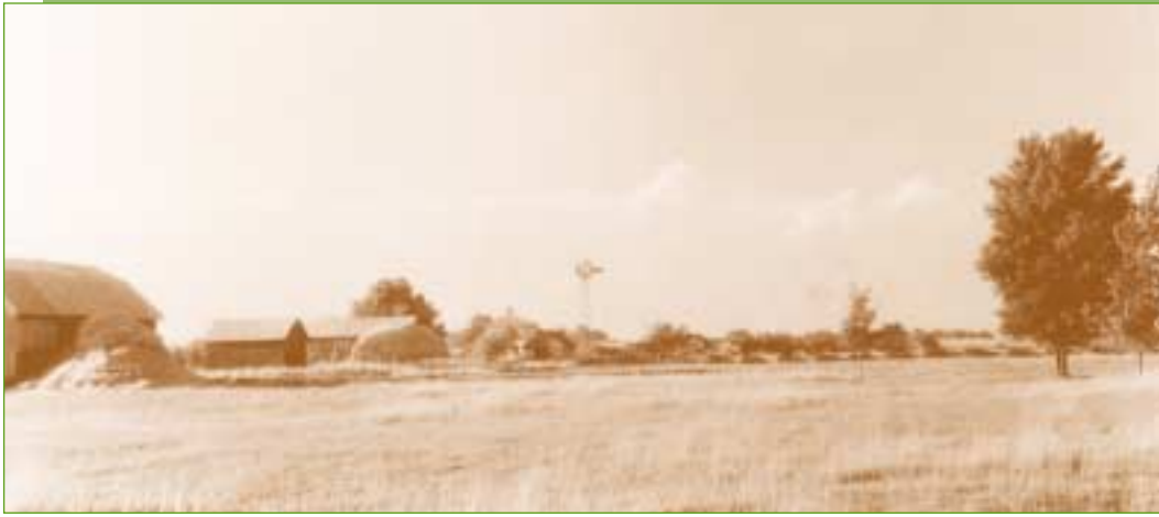
Lattimer family Michigan homestead

teur Athletic Union 200 meter hurdler (a record unbroken for 12 years) and winning the 50-yard dash at the Millrose Games. During his military service, he won the 200-meter hurdles for the 7th U.S. Army at the GI Olympics in Germany.