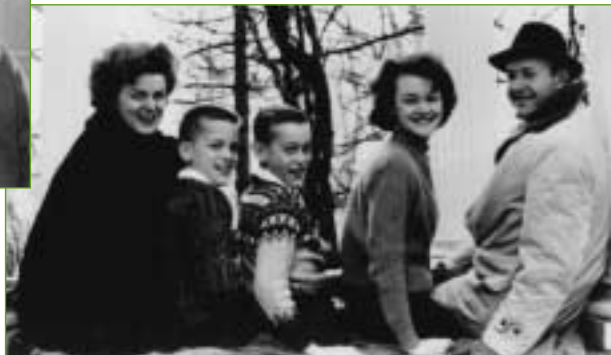
The Lattimer family