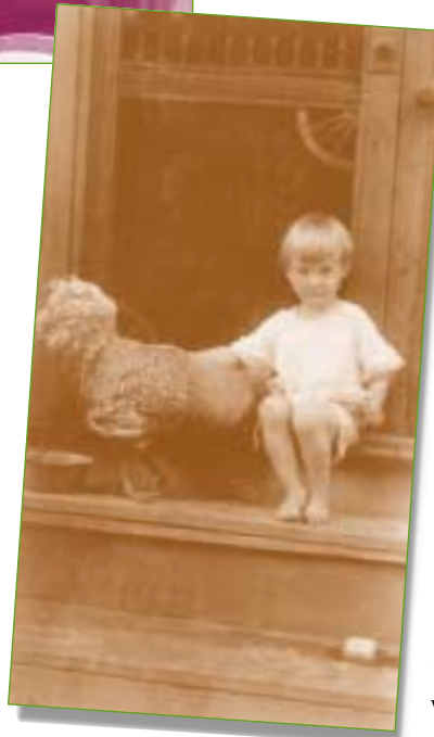
Future urologist with barnyard pet